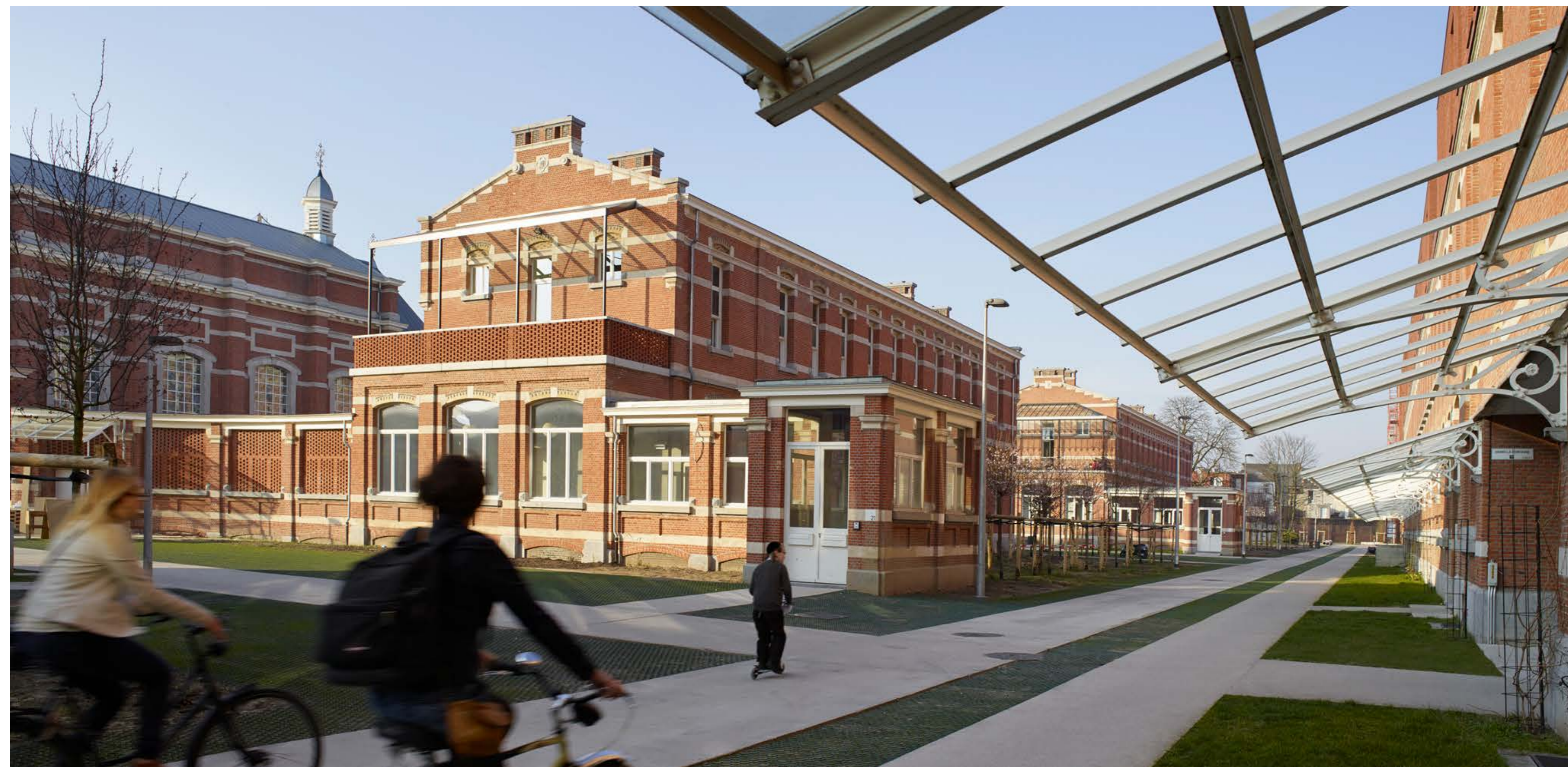
GROEN KWARTIER by Matexi in Antwerp, Belgium

Matexi Polska is one of the fastest growing developers on the Polish residential market.