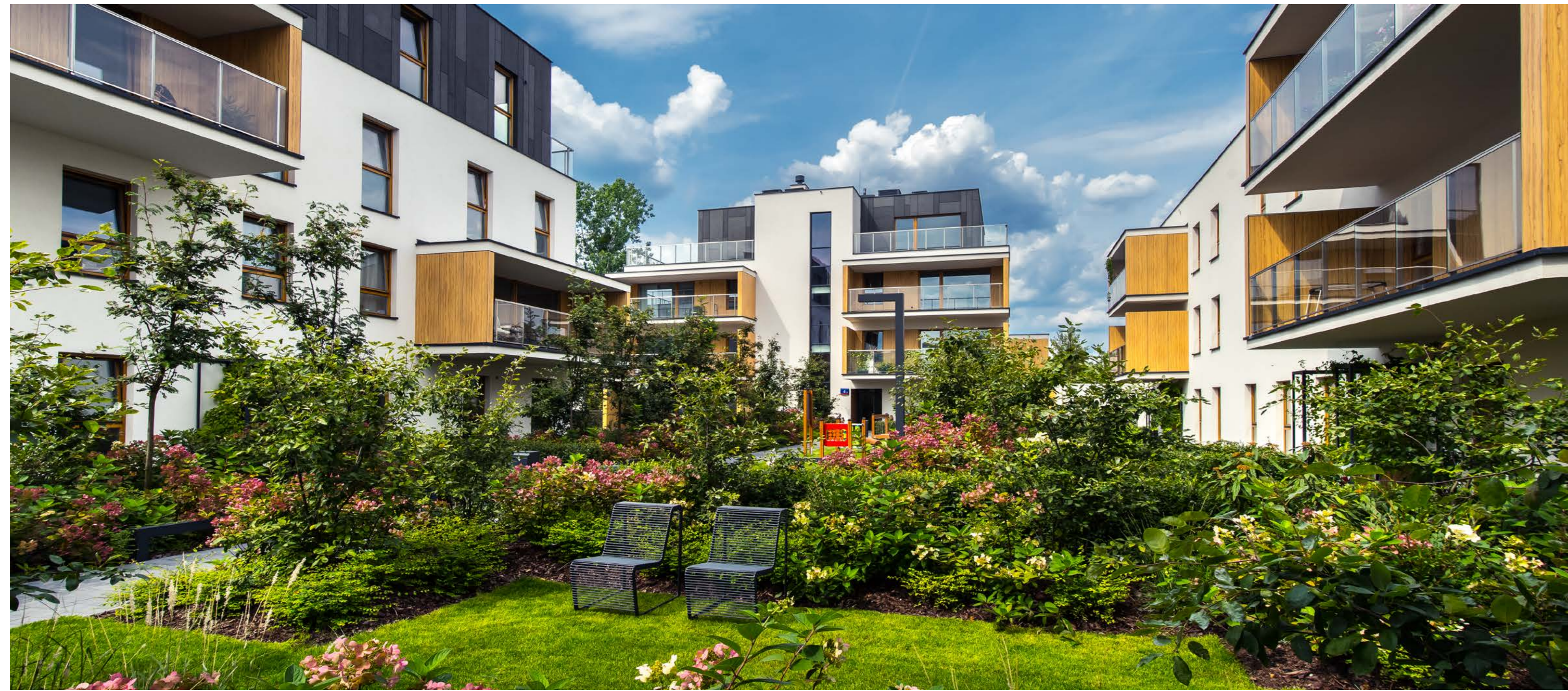
APARTAMENTY MARYMONT by Matexi in Warsaw, Poland