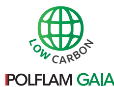
Pilkington Mirai ™ was chosen for the development of POLFLAM GAIA low-carbon fire-resistant glass. ▶

This cutting-edge product exhibits no compromise in performance, quality or aesthetic appearance and will be available for the whole range of products from EI15 up to EI180. Stay tuned as we embark on this transformative journey, shaping the future of the glass industry. ■